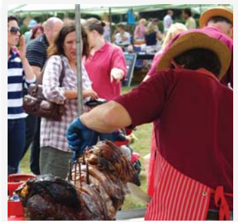
Events & Festivals